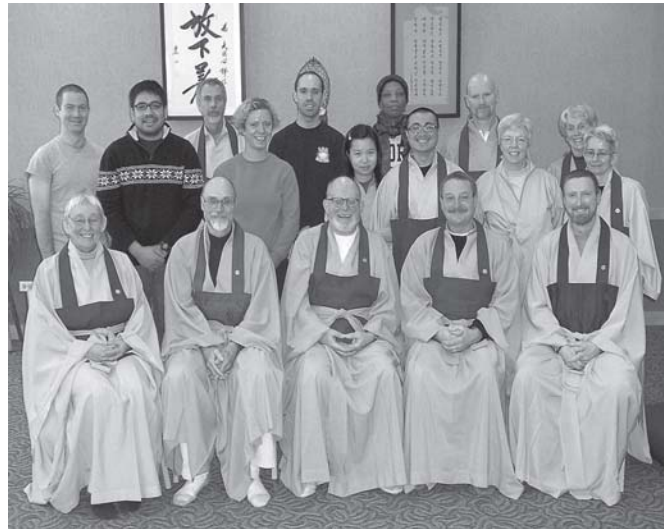
Buddha's Enlightenment Day at Lincoln Park Zen

Theosophical Society 1926 N Main St Wheaton, IL (630) 668-1571